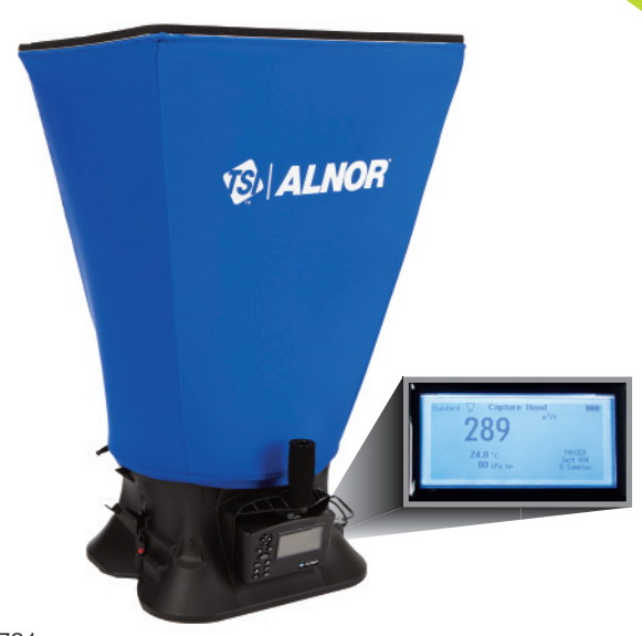
Model EBT731 (Accessories shown on following page)