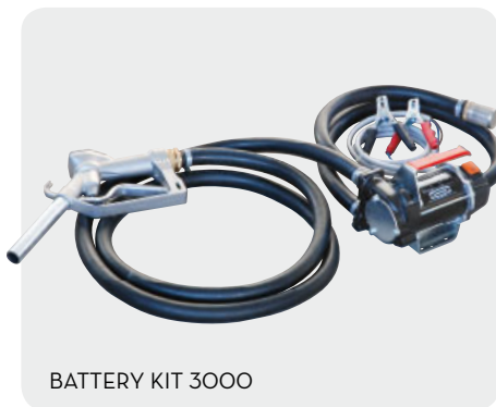
BATTERY KIT 3000