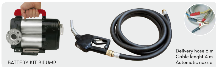
BATTERY KIT BIPUMP

Delivery hose 6 m Cable lenght 4 m Automatic nozzle