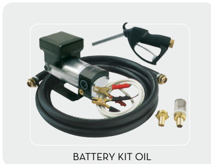
BATTERY KIT OIL