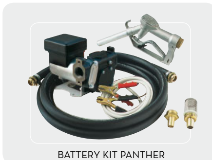
BATTERY KIT PANTHER