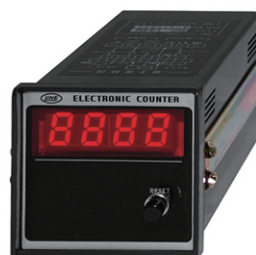
MDR - 040M