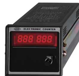
MDR - 060M