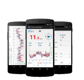
WINDY B/S - wind speed sensor